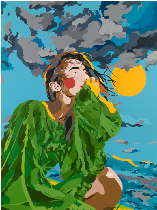
Lily Kemp, A Ripple in the Ocean , 2023, Acrylic on canvas (unvarnished), 120 x 90 cm